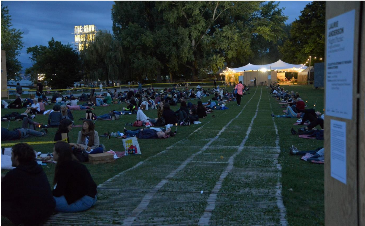
Festival atmosphere which could not be more beautiful «in the summer of Covid»: Collective Listening with the songs and stories by Laurie Anderson.

or from a bird's-eye view at the beach. They came to see the large-scale installations of William Kentridge, Tim Etchells and Shilpa Gupta on the Landwiese, which set the stage for three strong artistic statements. They sat down on picnic blankets under a starry sky for the Collective Listenings to audio pieces created by international artists especially for the Theater Spektakel.