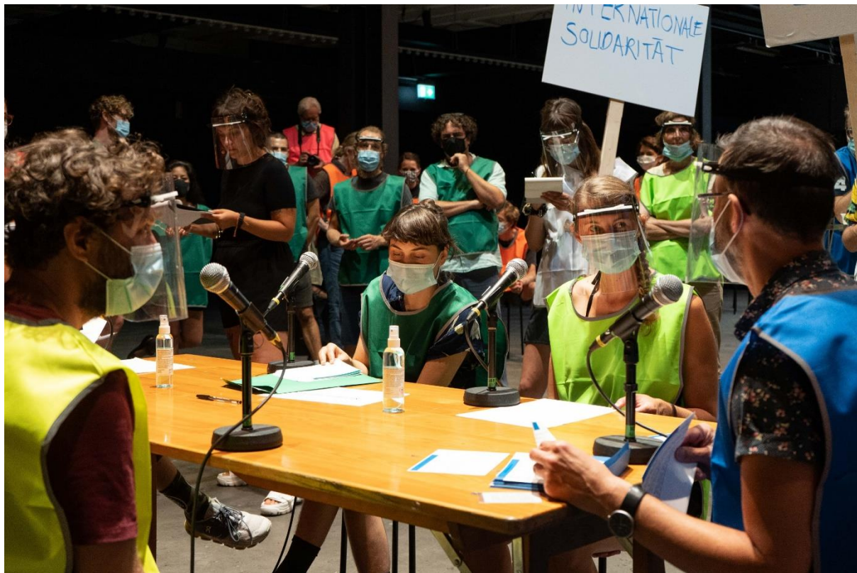
Facts and figures were crucial in the fight against the virus: The audience is stretched to its limits during the pandemic simulation «Virus» by Yan Duyvendak.