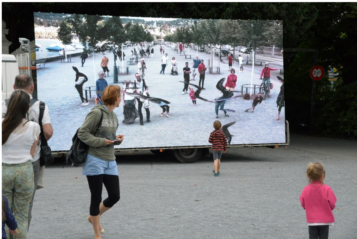
Dance the Forsythe: The mobile installation by William Forsythe set people in motion on its tour through Zurich. |

The festival direction would like to thank them and all other companies and hotels, which supported the festival with material and logistic contributions.